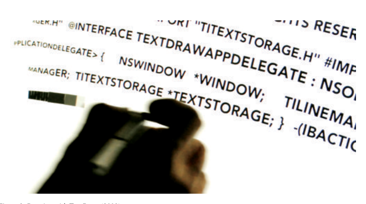
Figure 2. Drawing with TextDraw (2009)

writing software through which they are able to express their unique visions.[1,2,3,4] The latter can be seen in the development of Tangible and Graspable Interfaces which provide more natural affordances for control and interaction than the keyboard and mouse. Such kinds of interaction have been successfully applied to gaming, music, storytelling, and other computationally enhanced environments, but remain largely unexplored in the field of typography. [5,6,7,8] I am interested in developing new kinds of software / hardware interfaces as opportunities for returning to the field of typography, a physical quality that was lost when print moved to the screen.