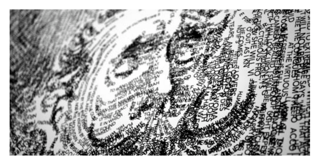
Figure 2. A photograph of The Don's Imagination (2009)

drawing words from different parts of a text.