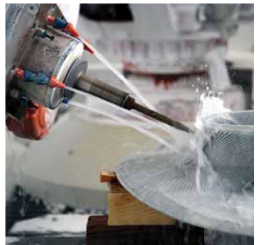
■ Costa Minimal Energy Surface in Marble, Matt Jezyk, Digital Stone Project, Tuscany 2014

For the Young Architects Program 2014 of the Museum of Modern Art and MoMA PS1, The Living designed and constructed a 40-foot-tall tower made of 10,000 compostable bricks. The complex geometry of the tower, the unusual new material, and the inability to cut bricks to size in the field presented a series of challenges. In order to address these challenges, the design team used generative modeling, unusual structural simulation, and intensive physical testing to bring the project to life.